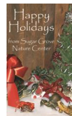
Turtles Under the Tree